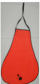
LB-140B Lift Bag