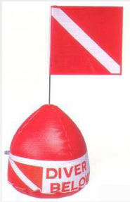
FB-01 Marker Buoy