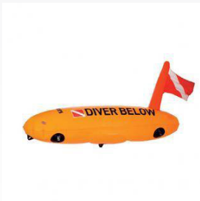
Mares - Torpedo Buoy