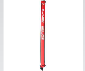
ST-01A Signal Tube