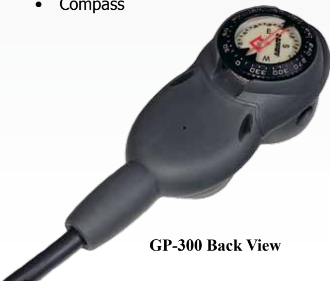
GP-300 Back View