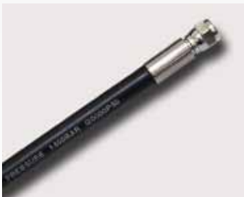
HP-300 High Pressure Hose