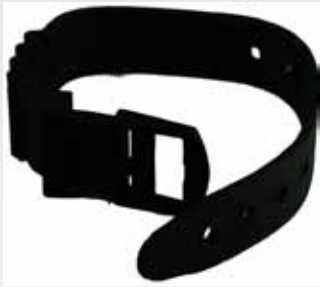
Strap for Compass & Deep Gauge