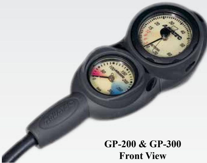
GP-200 & GP-300 Front View

The Aquatec Console modules and instruments can be combined in an almost infinite amount of combinations, allowing you to change or upgrade your console configuration as you want.