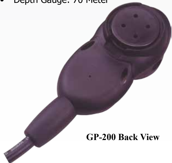
GP-200 Back View