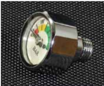
PI-1 Pony Bottle Pressure Indicator for BAR