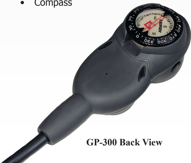
GP-300 Back View