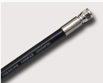
HP-300 High Pressure Hose