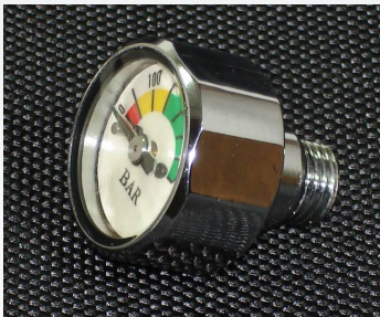
PI-1 Pony Bottle Pressure Indicator for BAR