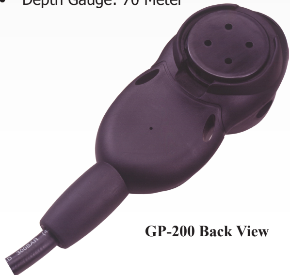
GP-200 Back View