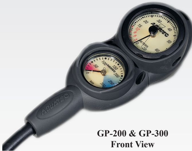
GP-200 & GP-300 Front View

The Aquatec Console modules and instruments can be combined in an almost infinite amount of combinations, allowing you to change or upgrade your console configuration as you want.