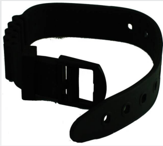
Strap for Compass & Deep Gauge